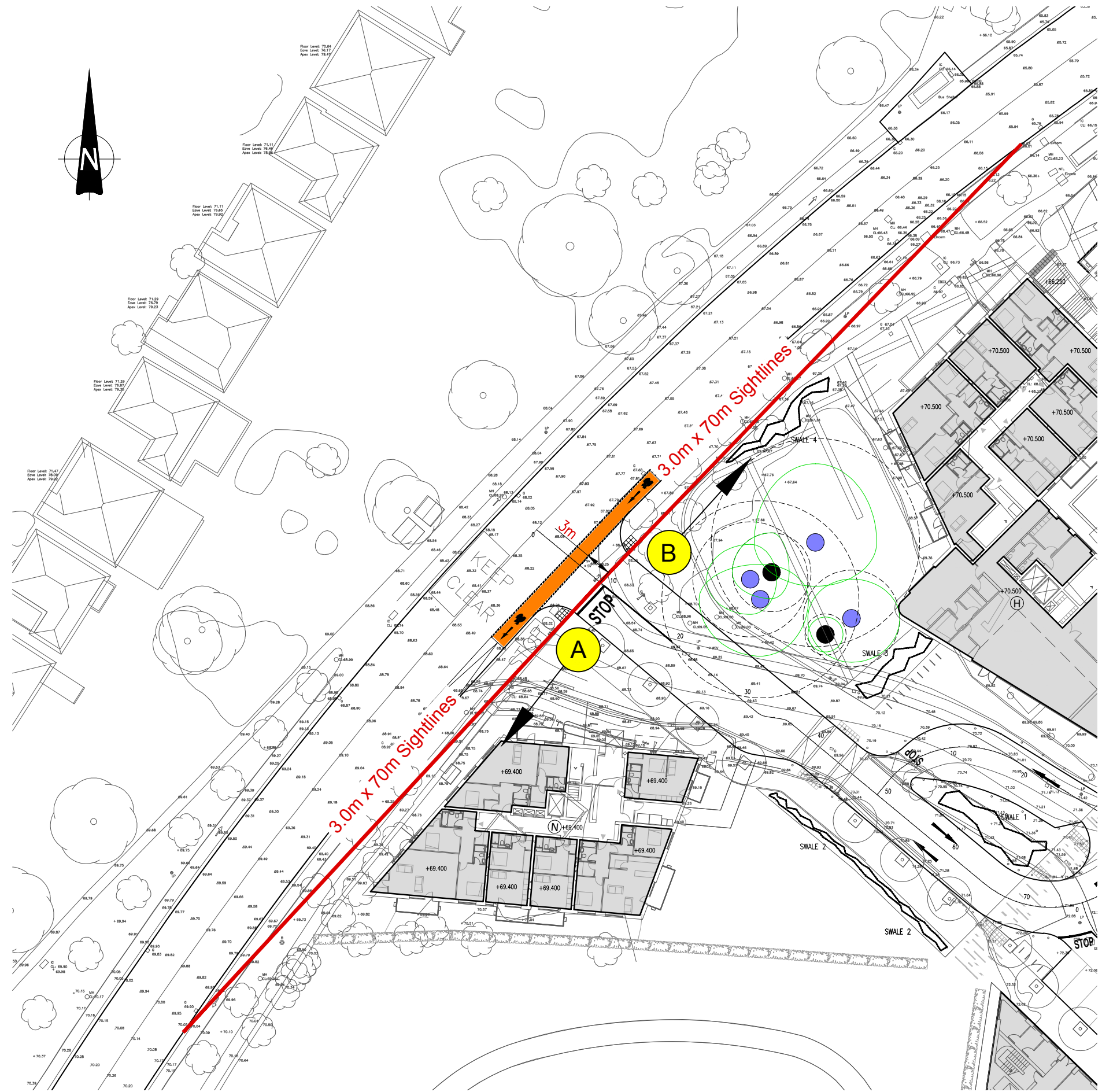
PLAN VIEW – ENTRANCE SIGHTLINES

SPEED LIMIT = 50 km/hr SIGHTLINES REQUIRED = 3m x 70m